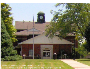
County Spotlight: Scott County

We need to ensure all attendees are able to stay at the conference rate. Please do not reserve more rooms than you need.