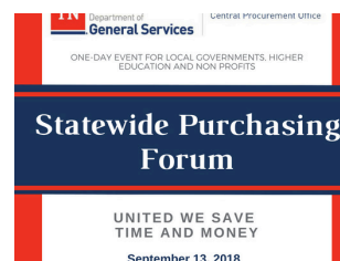
Statewide Purchasing Forum: Sept 13