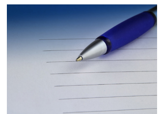
County Training Survey: Tell Us Your Needs