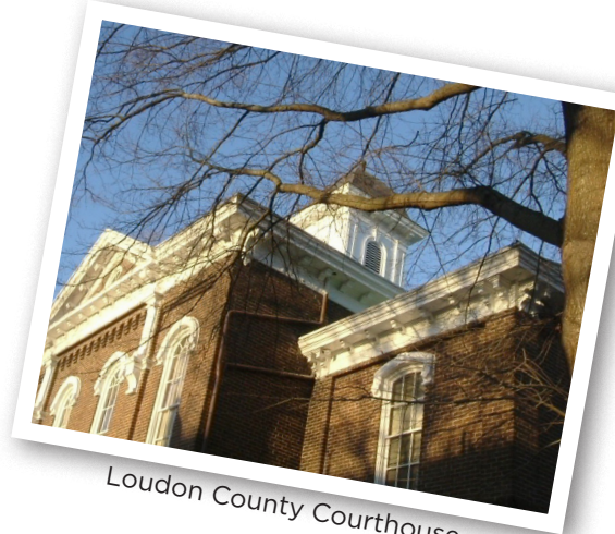
Loudon County Courthouse

One of the earliest American settlements in what is now Loudon County was a river port and ferry known as Morganton, once located on the banks of the Little Tennessee River near modern Greenback. Morganton thrived during the early 19th century, but declined with the rise of the railroad in the latter half of the century. The town's