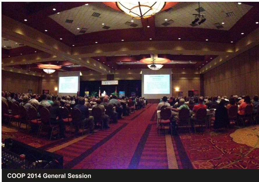
COOP 2014 General Session